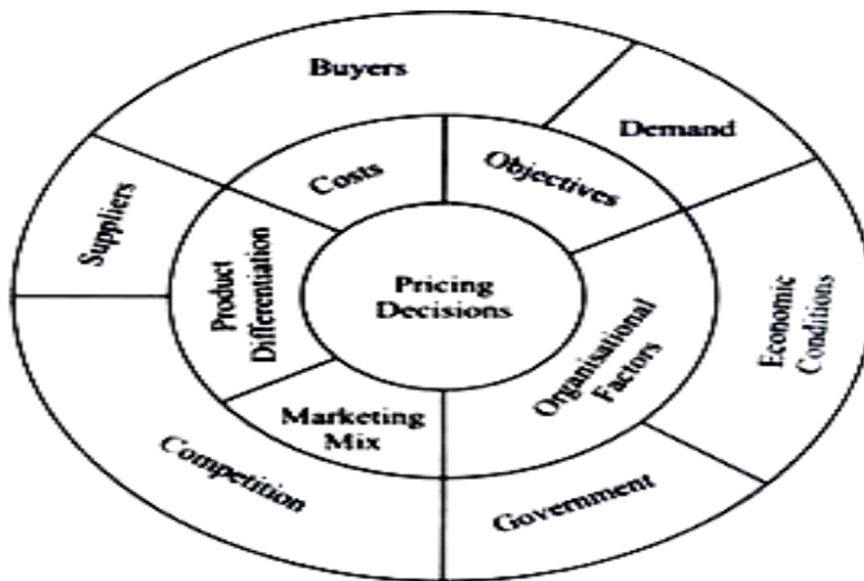
Factors Affecting Pricing Decisions

The influencing factors for a price decision can be divided into two groups: